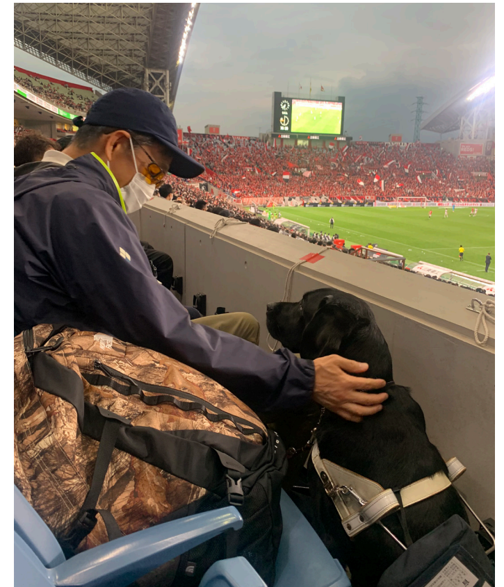
Guide dog user at Saitama Stadium