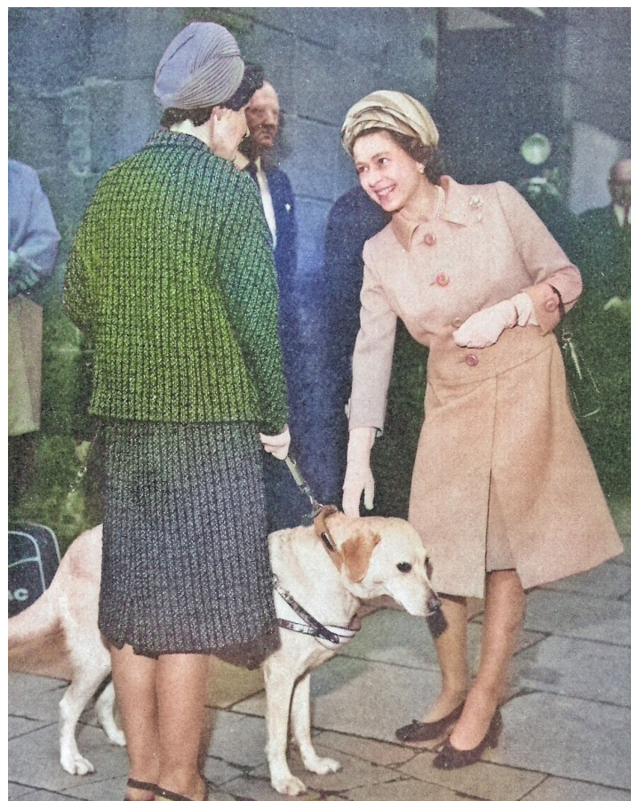
A young Queen Elizabeth greets a guide dog handler

No doubt, this shared love of dogs was a simple human connection made whenever a guide dog owner had the opportunity to meet the Queen. Guide dog owners often said that while their dogs gave them a great conversation starter, the Queen was more interested in the person behind the dog and always took the time to ask about them, often while the dog snored at their feet.