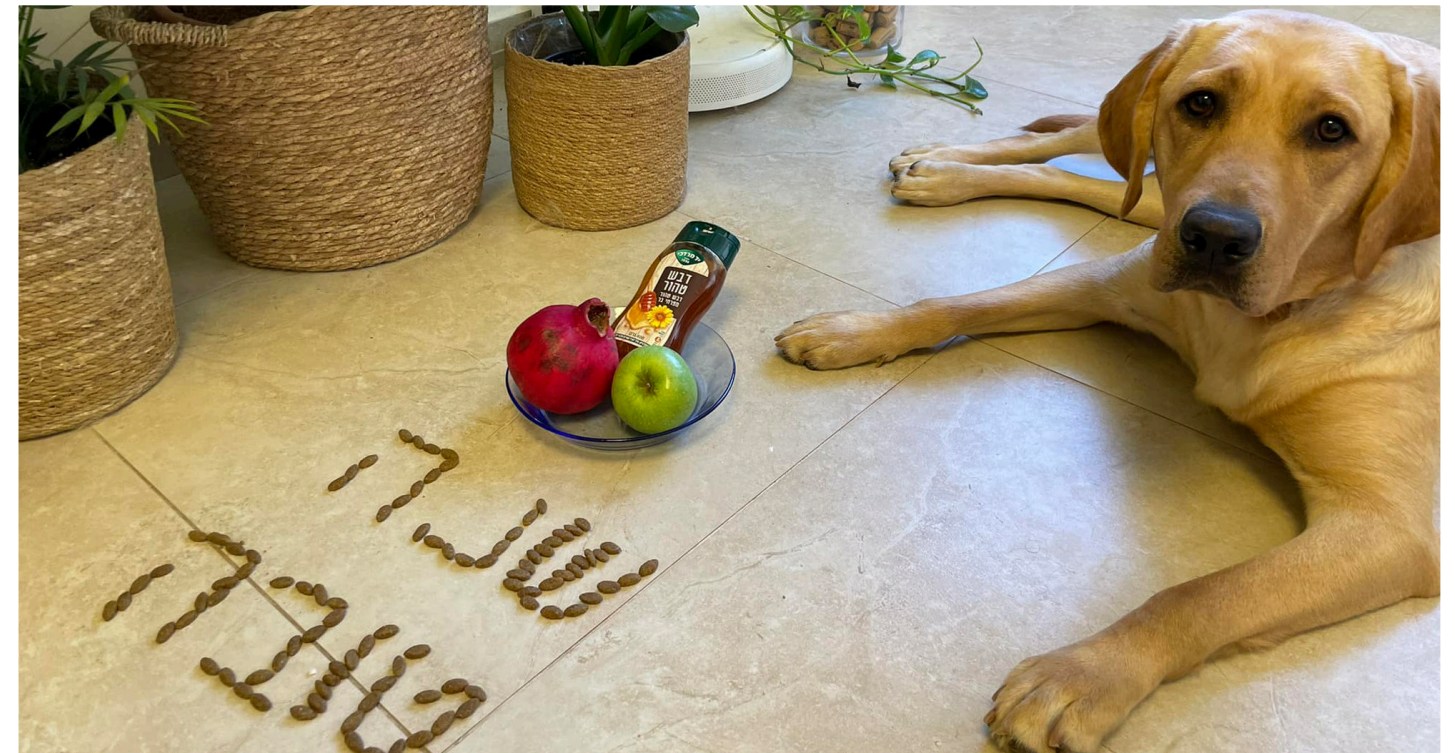
Celebrating the Jewish New Year at IGDCB

Many people build a temporary hut, called a sukkah to eat their meals. This 'tabernacle' is decorated with hanging ornaments, pomegranates and paper chains with a roof of palm fronds or bamboo matting. This holiday marks the fragility of life and the wanderings of Moses and the Israelites in the desert for 40 years.