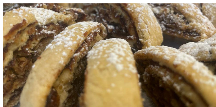
Date cookies for Rosh HaShana

A few days after Yom Kippur, we celebrate for 8 days the holiday of Sukkot, also known as the Feast of the Tabernacles.