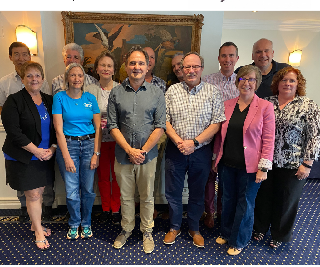
Joint meeting of the ADI and IGDF Boards