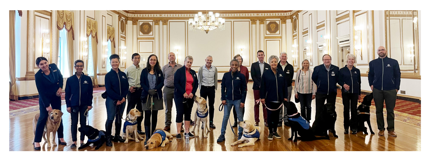
IGDF Board with BC & Alberta staff and volunteers and hotel staff

After a very long 5-year break, it finally happened. It felt like Christmas eve when we came together, at the Fairmont Vancouver hotel on April 27th, 2023. IGDF traditionally holds a conference every other year, and since the first gathering of guide dog professionals in 1973 took place in Paris, France, IGDF has organized 21 conferences. A special mention needs to be made to Mathilda Guide Dogs who were due to host the 2020 event in Prague but due to the pandemic, the conference was postponed to 2021 and finally cancelled.