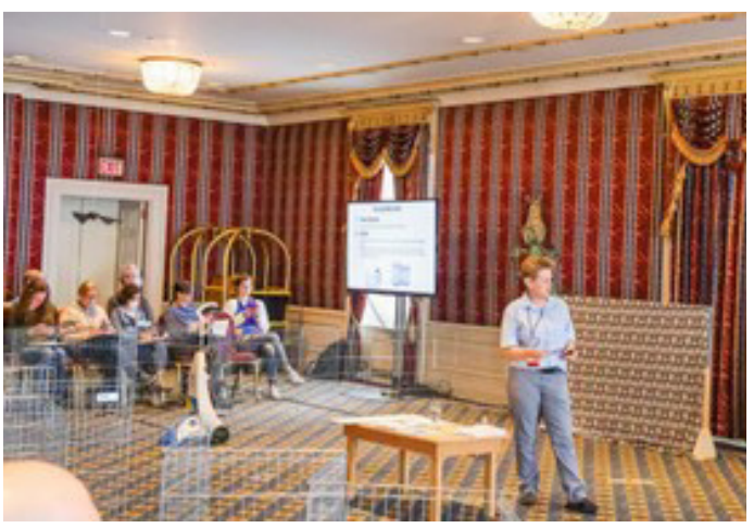
Behaviour Checklist Workshop

Finally, a special thanks to IGDF for the invitation and support in having this Breeders Workshop directly following the IGDF Seminar. Similar huge thanks to the planning and program committees, as well as to our many presenters for such a wonderful workshop, delivering hugely relevant topics and speakers of renown, in a well organised but relaxed and informal setting.