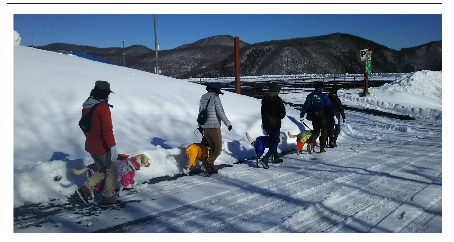
Five trainers and dogs walking along a ploughed snow wall on a shared road

The Japan Guide Dog Association provides guide dogs to approximately 250 guide dog users. About 30 % of these users live in regular to heavy snowfall areas. Therefore, in order to provide safe walking on snow-covered roads, we consider the effects of snow on orientation and mobility in our training.