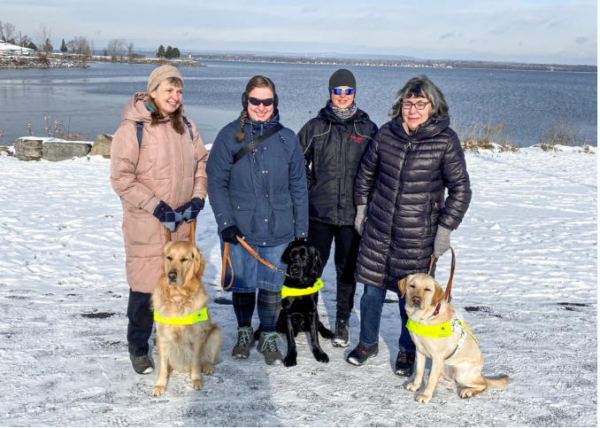
Class Training in November

As our clients across Canada use their guide dogs in all weather conditions, it is important that our dogs are trained in all weather. Therefore, at Canadian Guide Dogs for the Blind, we never let climatic challenges stop us from our mission.