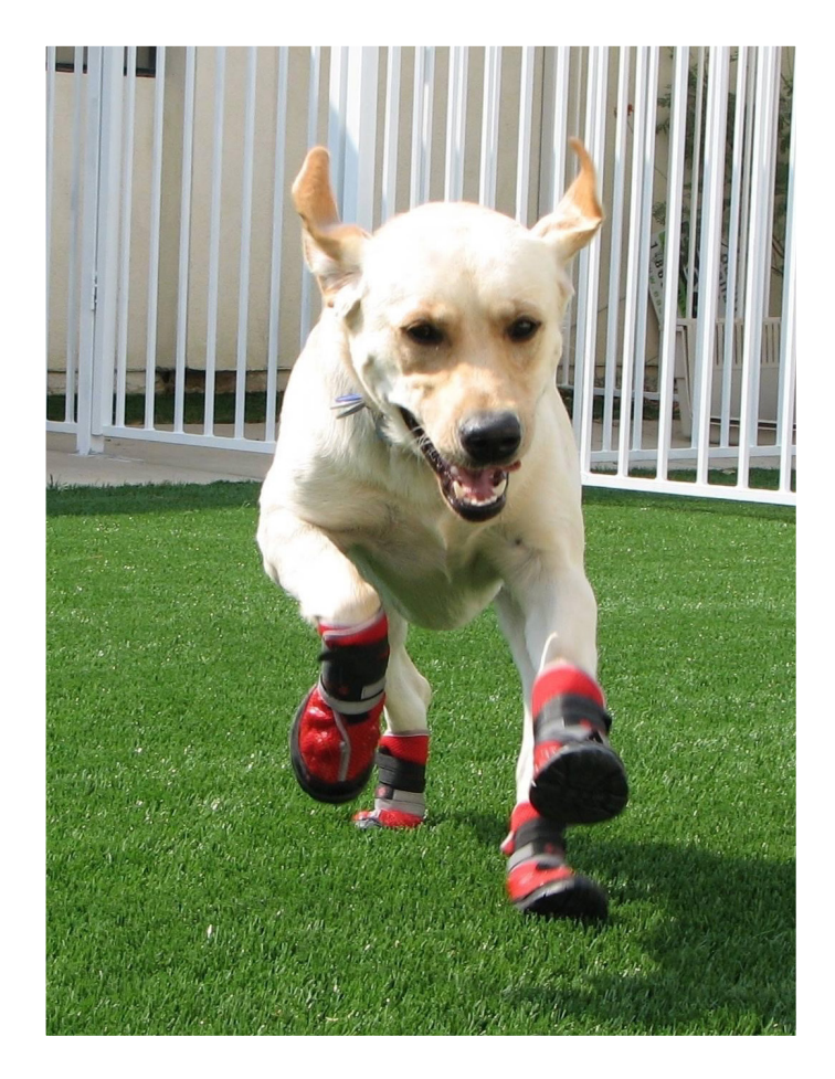
A training dog acclimating to their new boots through play

Guide Dogs of the Desert has been training Guide Dogs in Southern California since 1972. Located in Palm Springs, the dry desert landscape can bring on some challenges when it comes to training guide dogs. As temperatures begin to rise, the temperature of the roads and sidewalks can become 40-60 degrees hotter than the air temperature. While dogs typically have a high level of endurance and adaptability, they can be susceptible to injuries due to extreme temperatures. Our training program implements procedures that ensure safety and comfort for our guide dog teams.